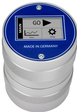
CMT Touch Cell

For example, water content analysis is critical in identifying contamination that can compromise lubrication performance. Even relatively low levels of water ingress can promote corrosion within engine components and piping systems, leading to progressive damage if not addressed early.