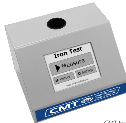
CMT Iron Console

Iron content analysis, particularly in cylinder drain oil, provides a direct indicator of engine wear. Monitoring iron