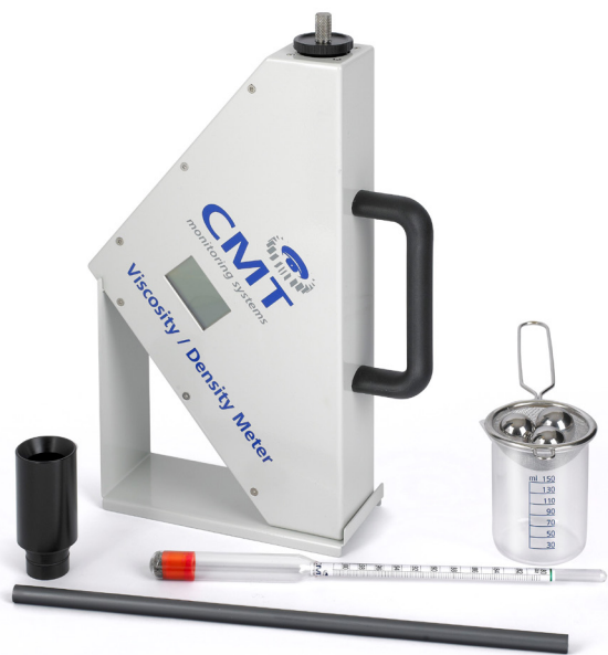
CMT Viscosity/Density Meter

The transition towards instrument-based testing further strengthens this framework. By reducing reliance on manual, reagent-based methods, the system improves repeatability and simplifies onboard procedures, enhancing the overall reliability of the data being collected.